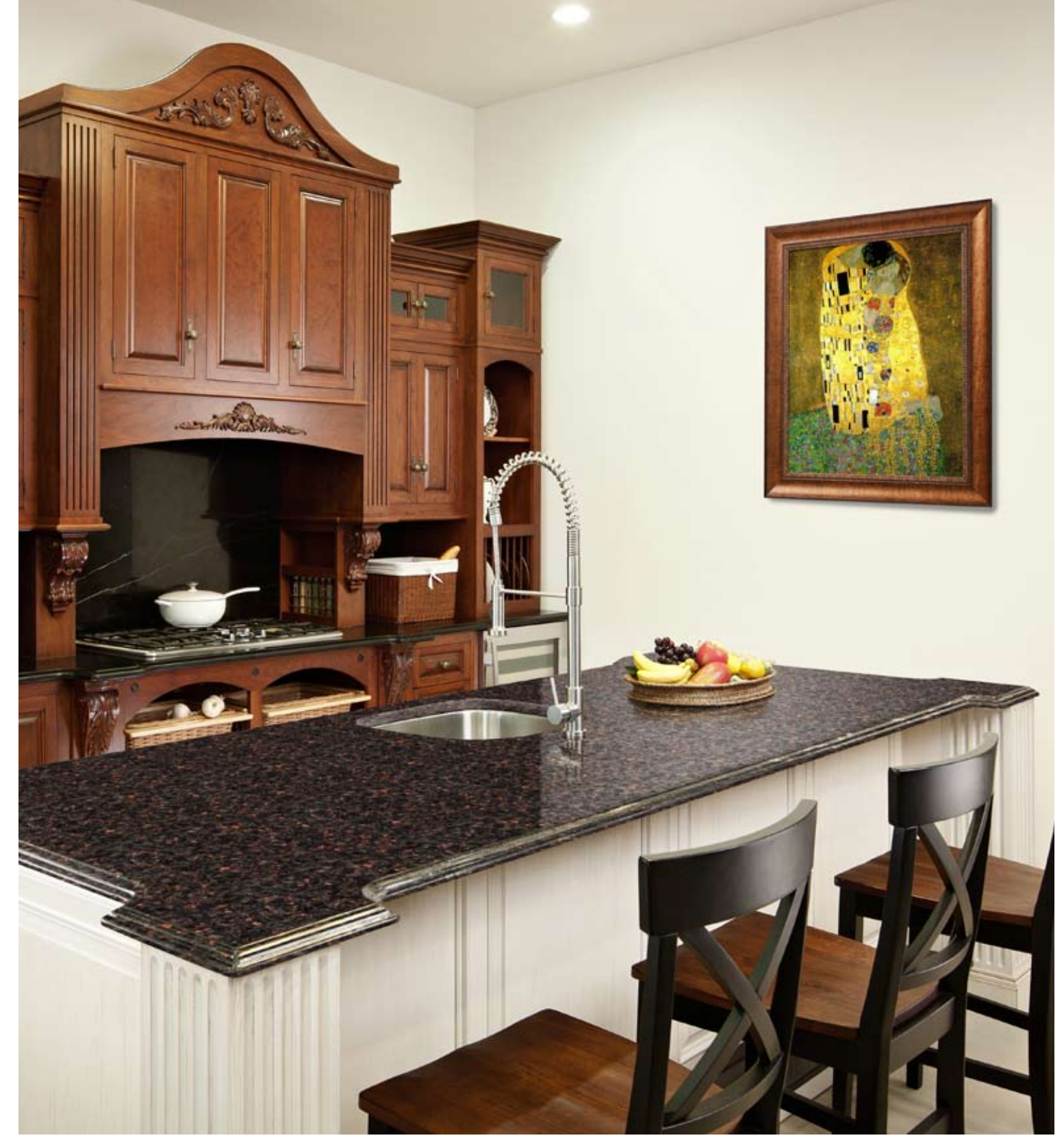
Ruvo K-binet in Kore