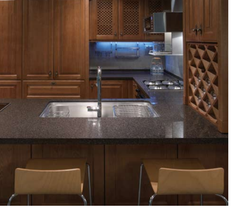
Kusshand in Korea