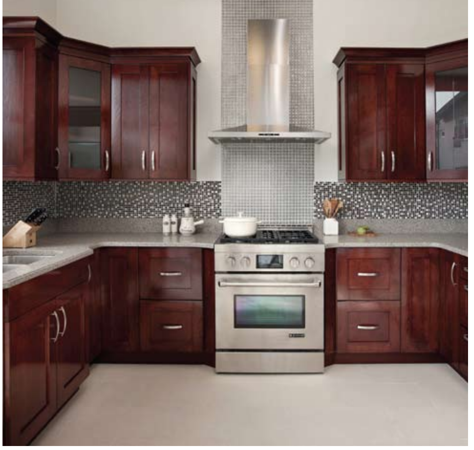
Ruvo K-binet in Korea