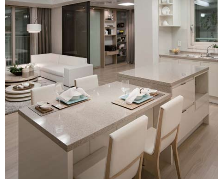
CES Kitchen in U.S.A