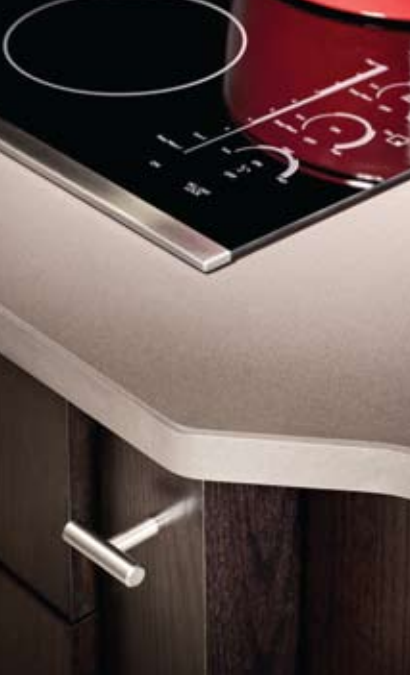
Kitchen in Korea