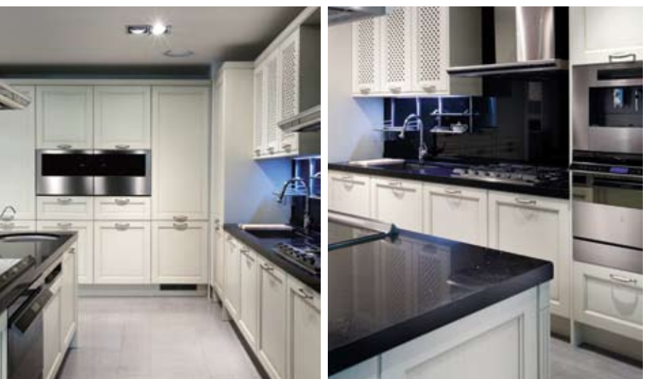
Kusshand in Korea